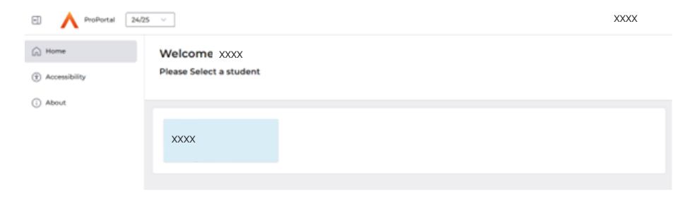
Home page where you select your child

Please Note: Access to ProPortal for Parents is only for parents/guardians of students who are 16 to 18 years old when they enrol at college. The college may need to suspend access to the system on occasions for maintenance purposes.